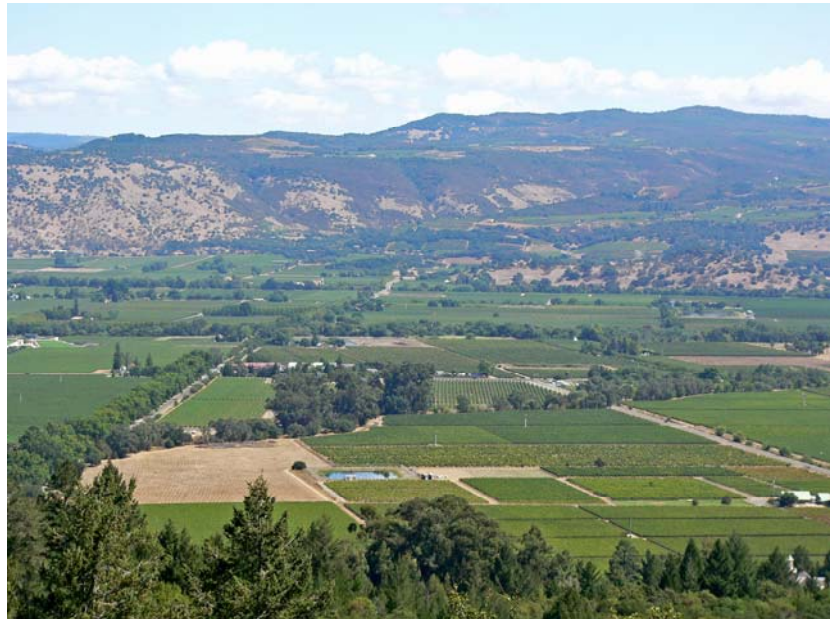
Napa Valley from Oakville Grade

A Meeting and Field Guide Book will be included in the registration fee.