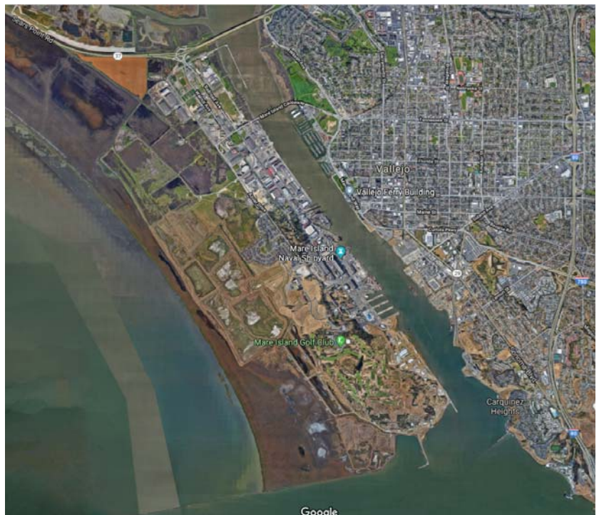
Google Maps: Mare Island